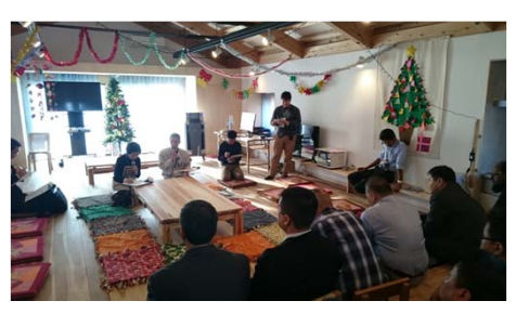
Photo: Community center located at Techno Temporary housing complex.

ADRC study visit participants discussed Mashiki town officials evacuation and organisation of temporary housing complex towards immediate recovery for affected residents.