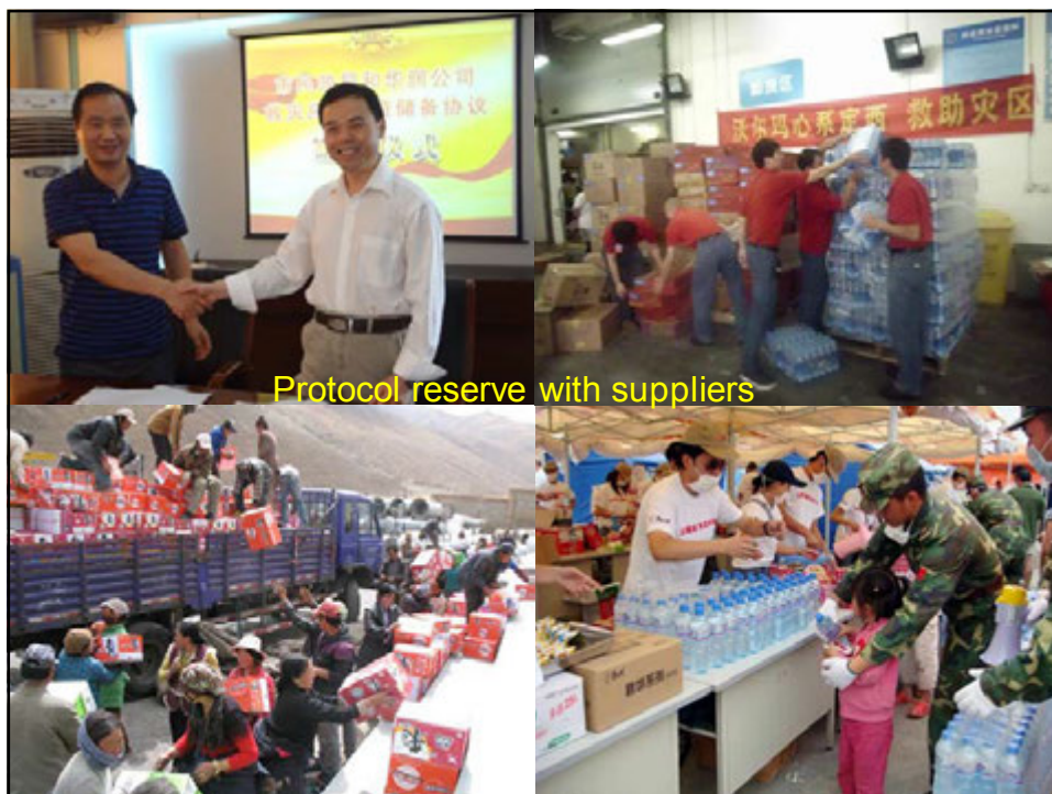
Protocol reserve with suppliers