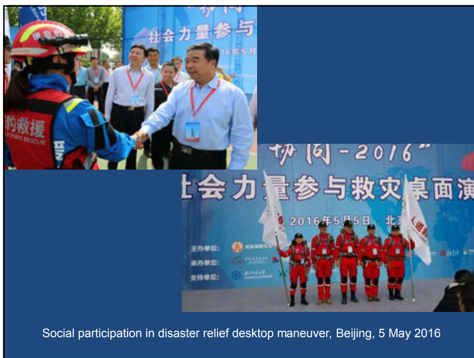
Social participation in disaster relief desktop maneuver, Beijing, 5 May 2016