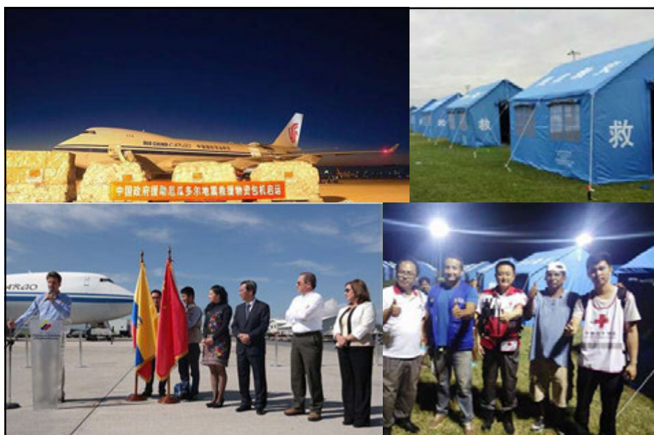
The Chinese government and NGOs provided humanitarian aids to Ecuador earthquake-hit area in April 2016.