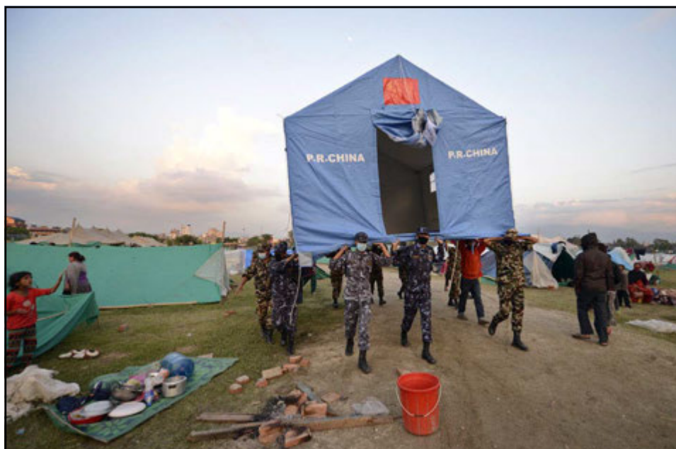
The Chinese government and NGOs provided humanitarian aids to Nepal earthquake-hit area in April 2015.